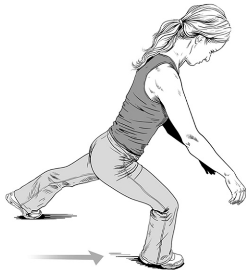
Figure 3 Common mistake.