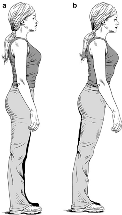
Figure 1 a, b Vele's forward lean. The Janda Lunge (See Figure 1a,b Vele's forward lean).