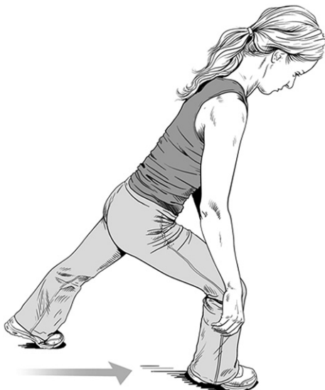
Figure 2 Forward lunge in a plank.